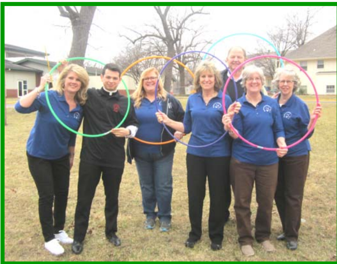
Members of the parish staff have fun with hula hoops to promote “Hope In Motion.”

All parishioners are invited to participate in this activity that promotes faith, family and fitness while reaching out in support to those who hunger. The event will kick-off at Masses the weekend of March 25-26 and will conclude the weekend of April 1-2. Specific details about this event and how you and your family can participate will be available in upcoming bulletins and the parish website.